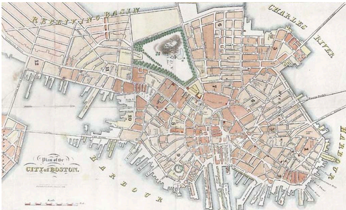
Pocket map Plan of the City of Boston , 1832

JANUARY 24, 2007 / CONTRIBUTED BY: BLACKPAST